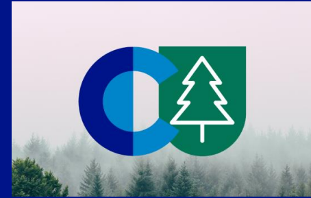
FORESTS AND CLIMATE