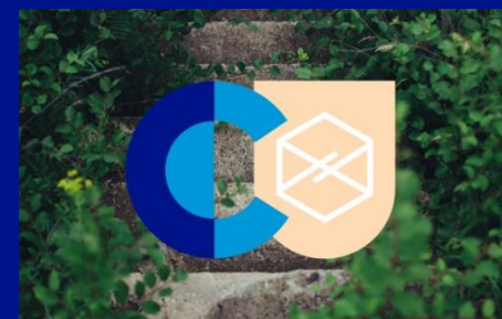
LEADERSHIP FOR SUSTAINABLE CHANGE