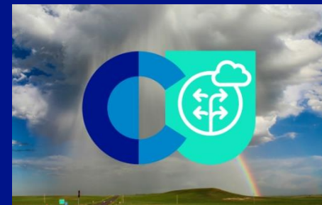
LIVING WITH CHANGING CLIMATE