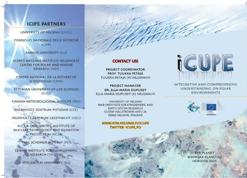
Figure 2 A snapshot of iCUPE flyer