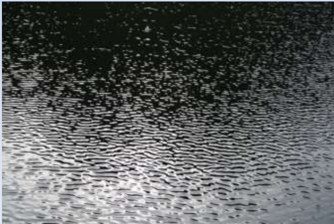
swell in the water is a sign of a storm