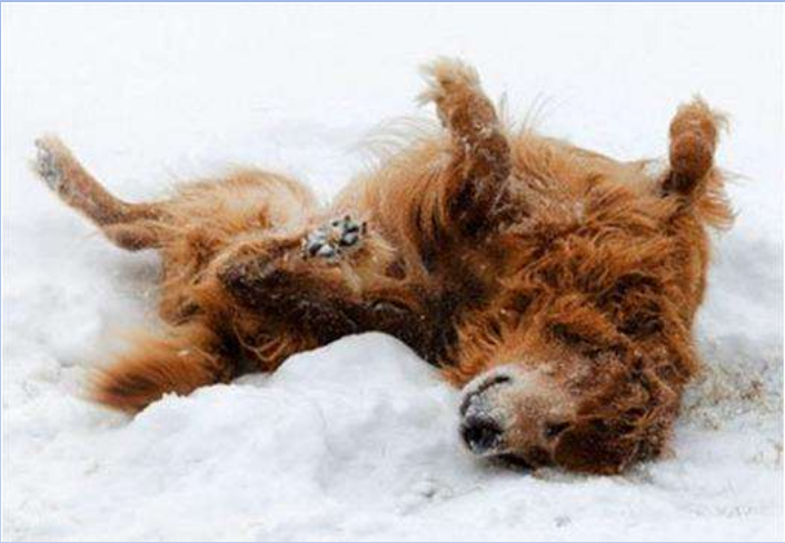
dog wallow in the snow