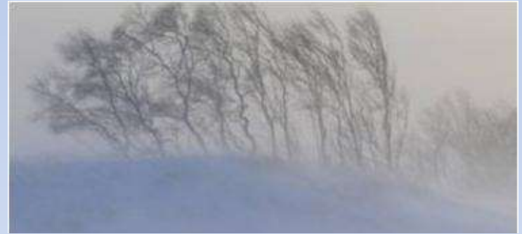
increased wind should be considered a sign of an impending blizzard