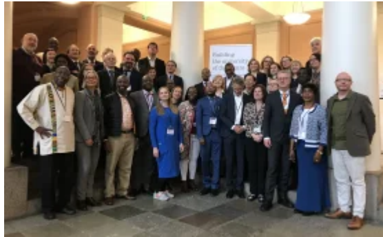
Representatives from Una Europa and partner African universities meeting in Helsinki.

Paris - Article #328026 - Écouter cet article