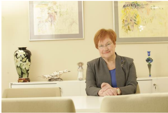
Sustainable development as a concept and in politics President Tarja Halonen