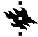
UNIVERSITY OF HELSINKI